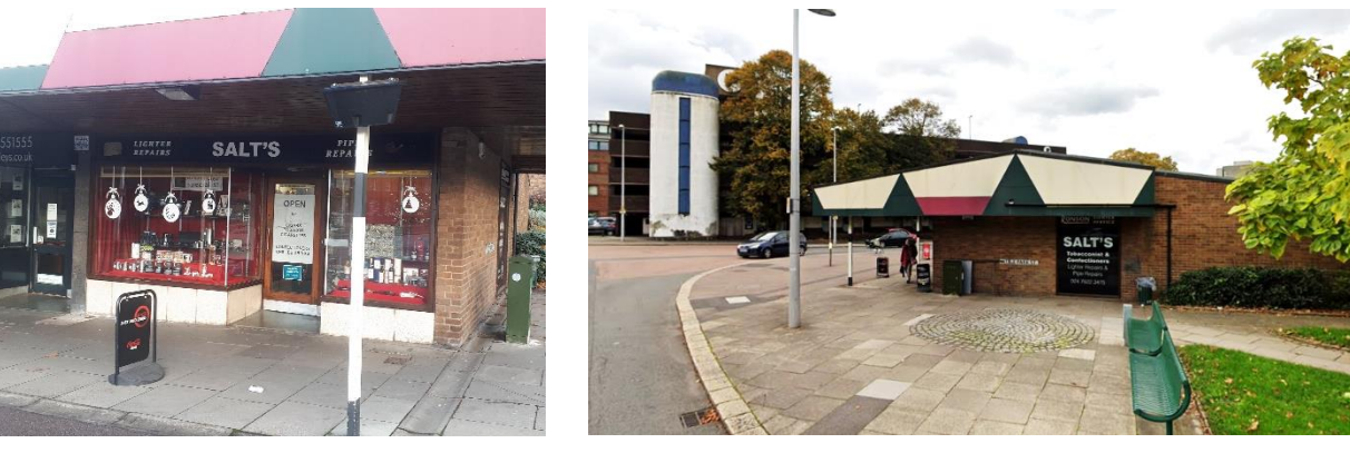
Figure 1. Salt's Tobacconist frontage toward junction of New Union Street and Little Park Street

Salt's Tobacconist's, 1 New Union Street, Coventry, CV1 2HN.