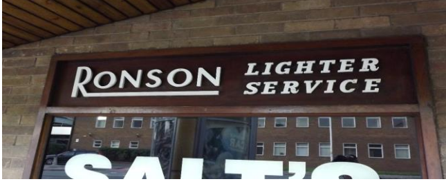
Figure 3. External signage style toward Little Park Street, conveying understanding of development period