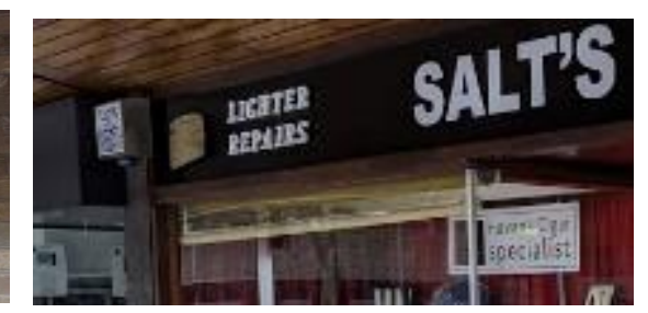
Figure 4. External signage style toward New Union Street